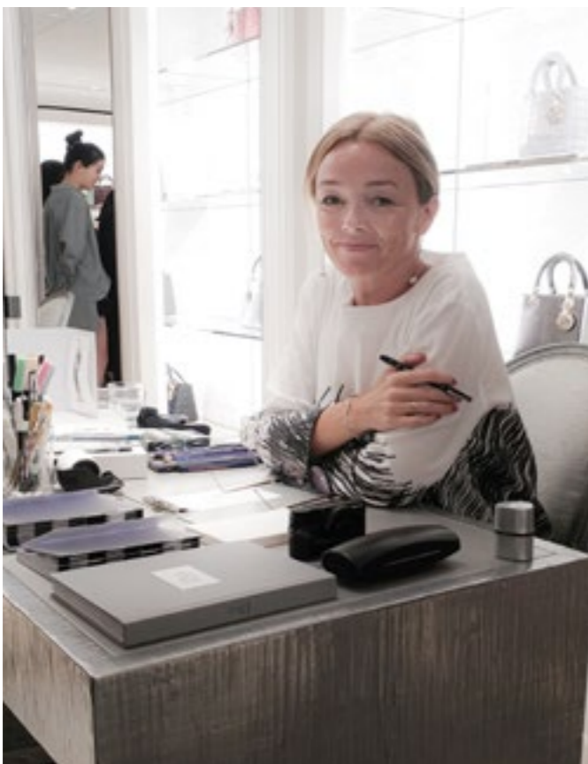
For CHRISTIAN DIOR COUTURE at the Dior Boutique in Frankfurt