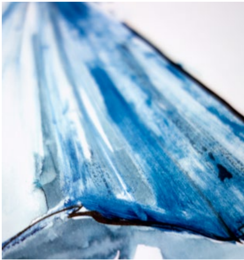
For L'ORÉAL PARIS at the Dreamball charity gala, Berlin