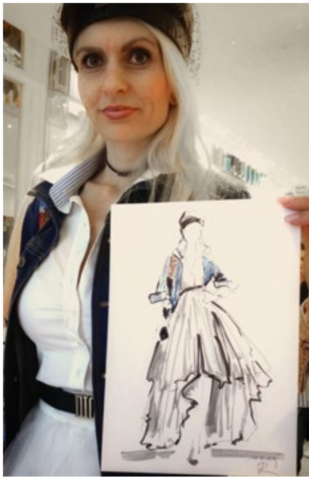
For PARFUMS CHRISTIAN DIOR at the Duftstars in the Steigenberger Hotel and at the Christian Dior Couture boutique, Dusseldorf