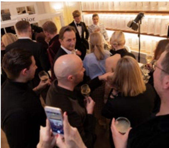
For PARFUMS CHRISTIAN DIOR at the VOGUE Germany Christmas party, Munich