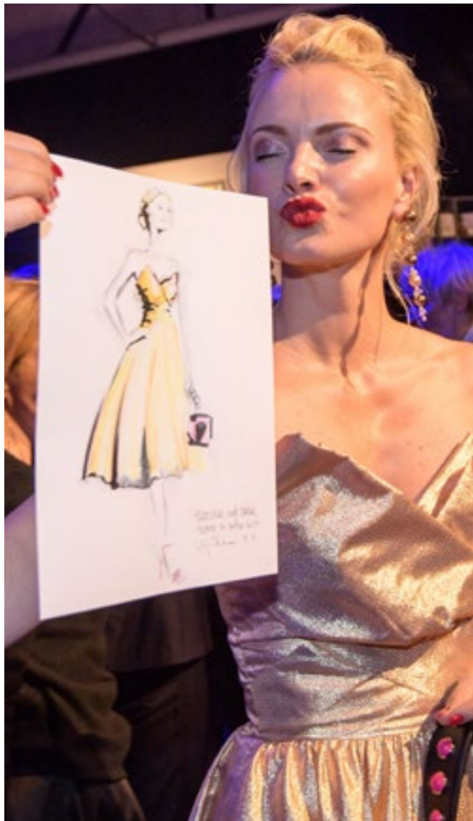
For MADELEINE MODE at the Tribute to Bambi charity gala, Berlin