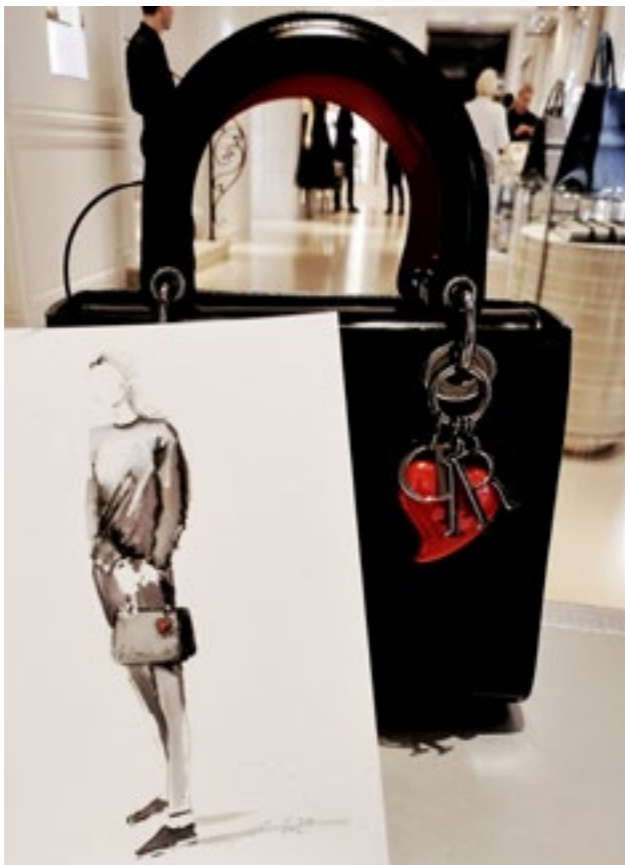
For CHRISTIAN DIOR COUTURE presentation of a new Dior Lady Art collection at the Dior Boutique in Vienna