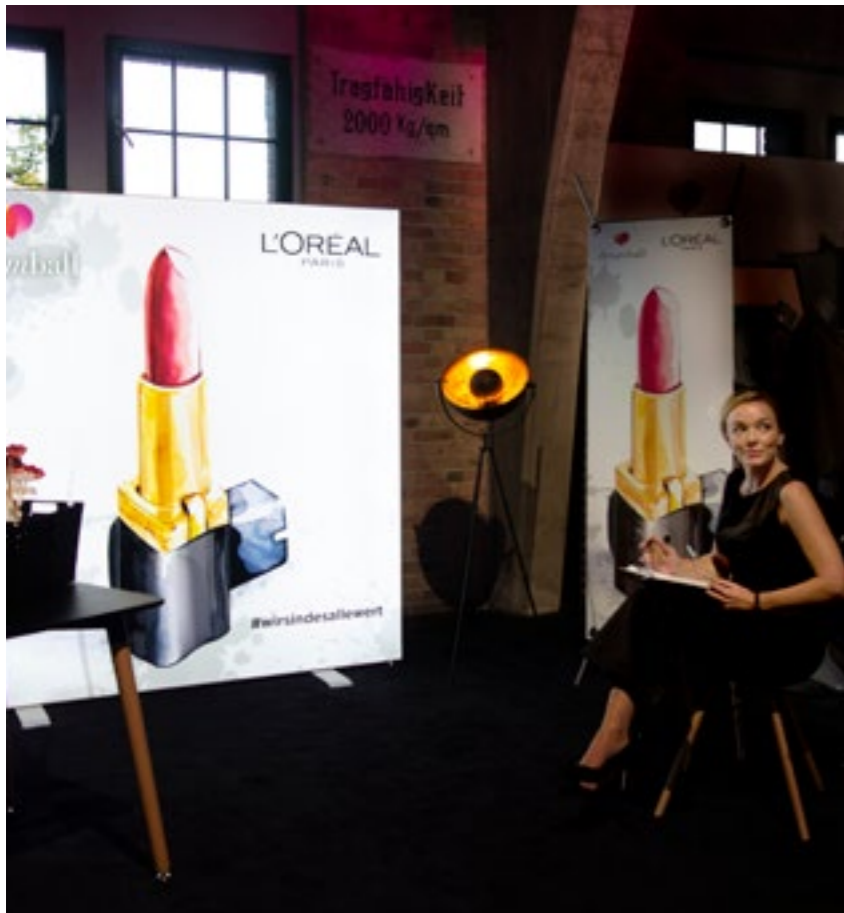
Fashion sketches drawn with L'Oréal Paris cosmetic products