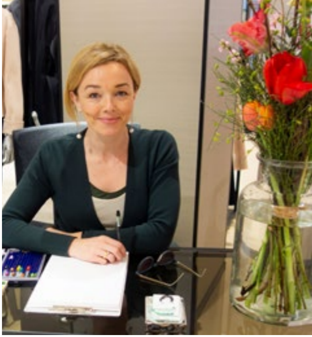
For HUGO BOSS at Breuninger, Dusseldorf