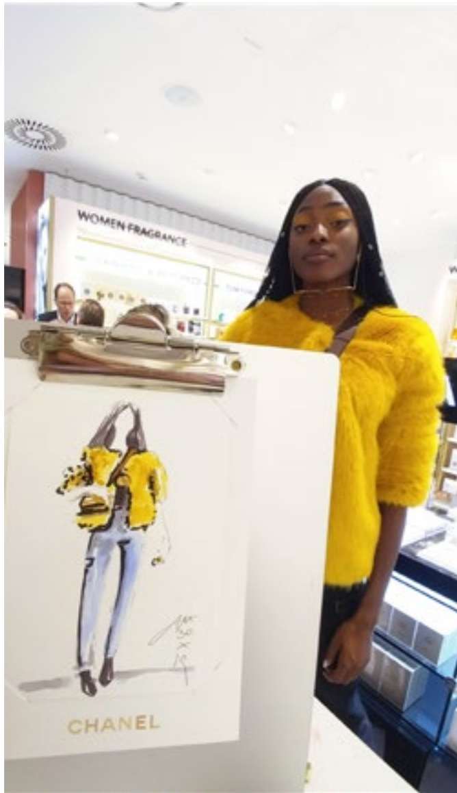
For CHANEL at the reopening of the Douglas boutique in Unter den Linden, Berlin