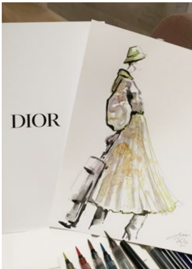
For CHRISTIAN DIOR COUTURE presentation of a new Dior Lady Art collection at the Dior Boutique in Munich