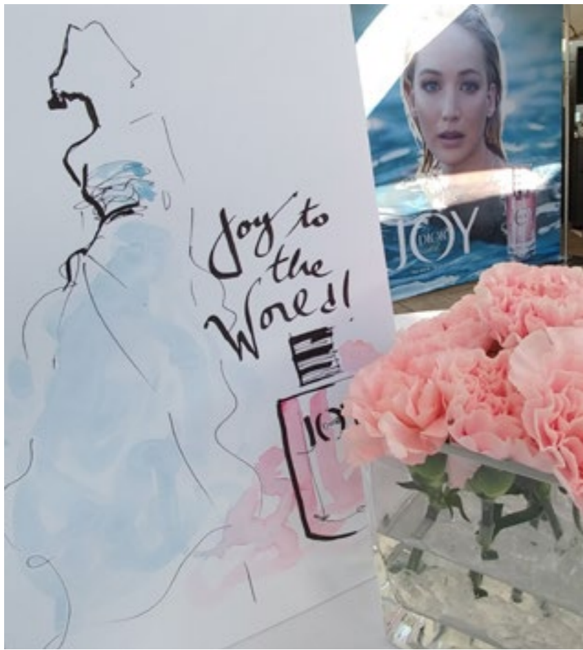
For PARFUMS CHRISTIAN DIOR at the German launch of JOY. at Oberpollinger, Munich