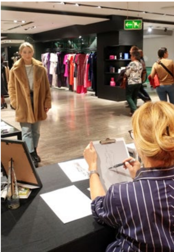
For HUGO BOSS at Breuninger, Dusseldorf