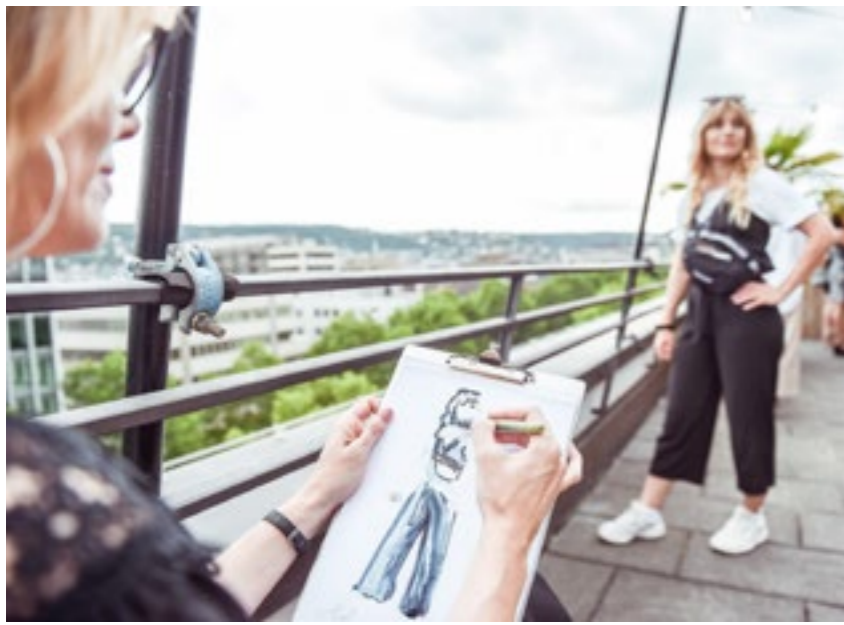
For LILLET at Les Ateliers Lillet, Stuttgart