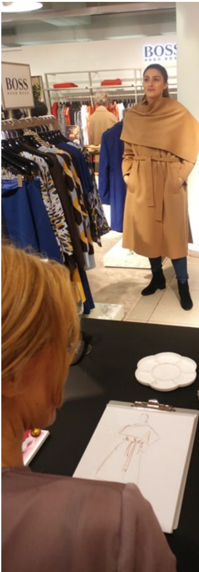
For HUGO BOSS at Steffl, Vienna